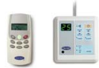
Remote Control (Optional)

The new 42VDT-W Series , flexible floor/ceiling type, offers concentrated high technology in an aesthetically pleasing design. Their broad operating range make them suitable for any applications; individual air conditioning of small shops, apartments, hotel, hospital or air conditioning of new office.